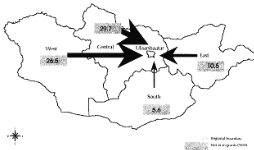
Figure 6.1 Number (x1000) of Net In-migrants to Ulaanbaatar by Region, 1995-2000

Among the migrants, there are more men than women. For example, in 1999, there were 42,900 migrant men against 36,100 women. Most migrants were in the 15-25 age group; this was true of both men and women. However, it is not clear what proportion of migrants were travelling with their family.