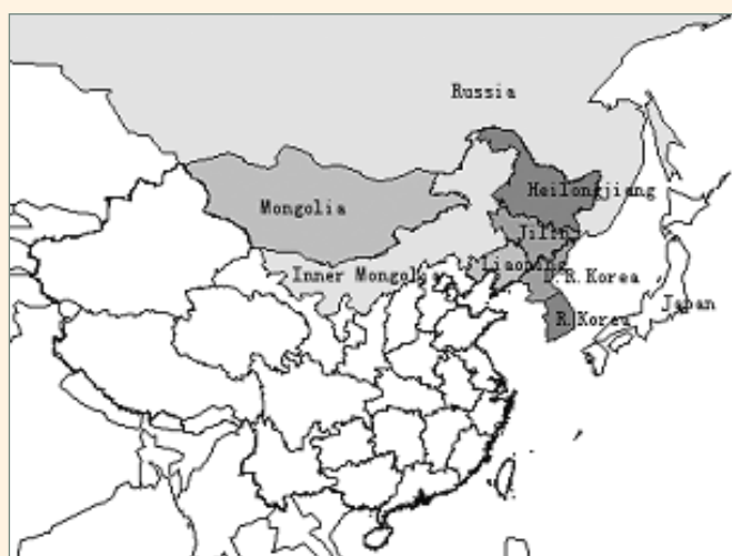
Figure 3.1 The Study Area in North East China

areas and significant from an inter-country migration perspective. These areas will be referred to as the 'study area' throughout the report. The geographic location of the area is marked in Figure 3.1 along with Mongolia, the Democratic People's Republic of Korea (DPRK) and the Republic of Korea