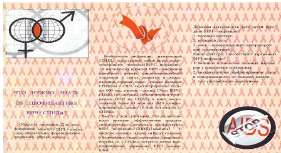
Figure 3.3 An AIDS prevention education leaflet in Russian

Up until now, there were only a few projects or programmes that specifically targeted migrants. There are hardly any comprehensive investigations into understanding the size, status and potential risk of HIV infection among migrants, especially those who work in 'unregulated' jobs. The needs and preferences of different sub-populations of