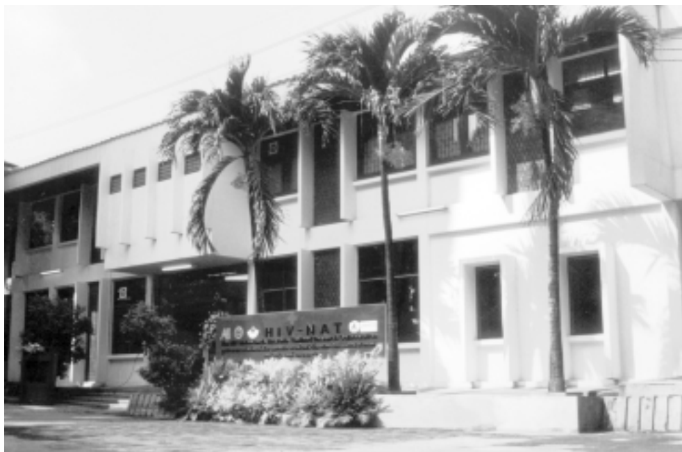
New HIV-NAT office on Rajdumri Road