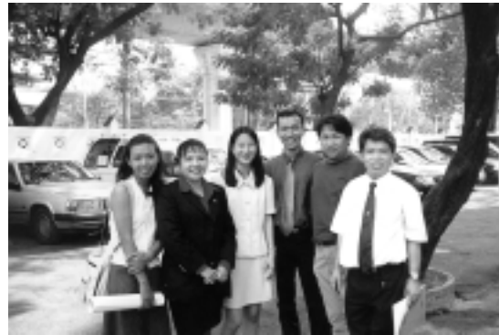
Wednesday Friends Club and friends

HIV-NAT has been fortunate in that the largest organized group of people living with HIV (PWH) in Thailand, the Wednesday Friends' Club, is part of the Thai Red Cross AIDS Research Centre of which HIV-NAT is also a branch. This means that lines of communication with the population most affected by HIV are short and that criticism and suggestions of our PWH colleagues can easily be incorporated into HIV-NAT's operations and future