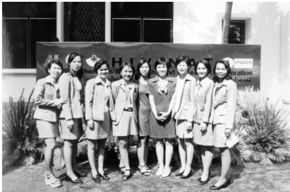
Nurses at the new building

These precedents are making it less difficult to convince other sponsors that they cannot simply count on the participants, the Thai government, and HIV-NAT to take on the burden of trying to provide follow-up treatment for former study participants.