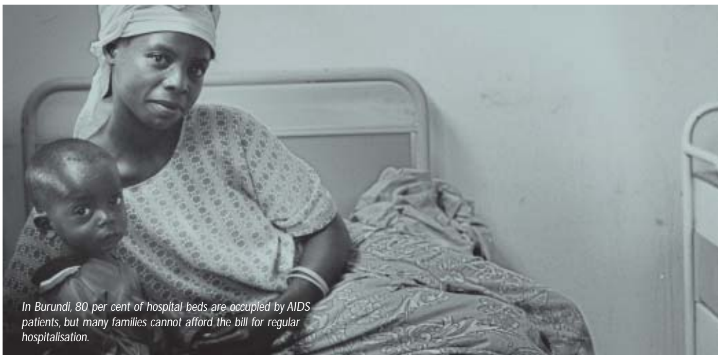
In Burundi, 80 per cent of hospital beds are occupied by AIDS patients, but many families cannot afford the bill for regular hospitalisation.

The threat of HIV/AIDS to millions of people, especially young people, in conflict areas must be acknowledged by the international community as a double emergency and a widespread violation of children's fundamental rights to life, protection and assistance. Any international response should be based on children's rights, an understanding of the epidemiology and also of the very real threats posed to community, national and international security.