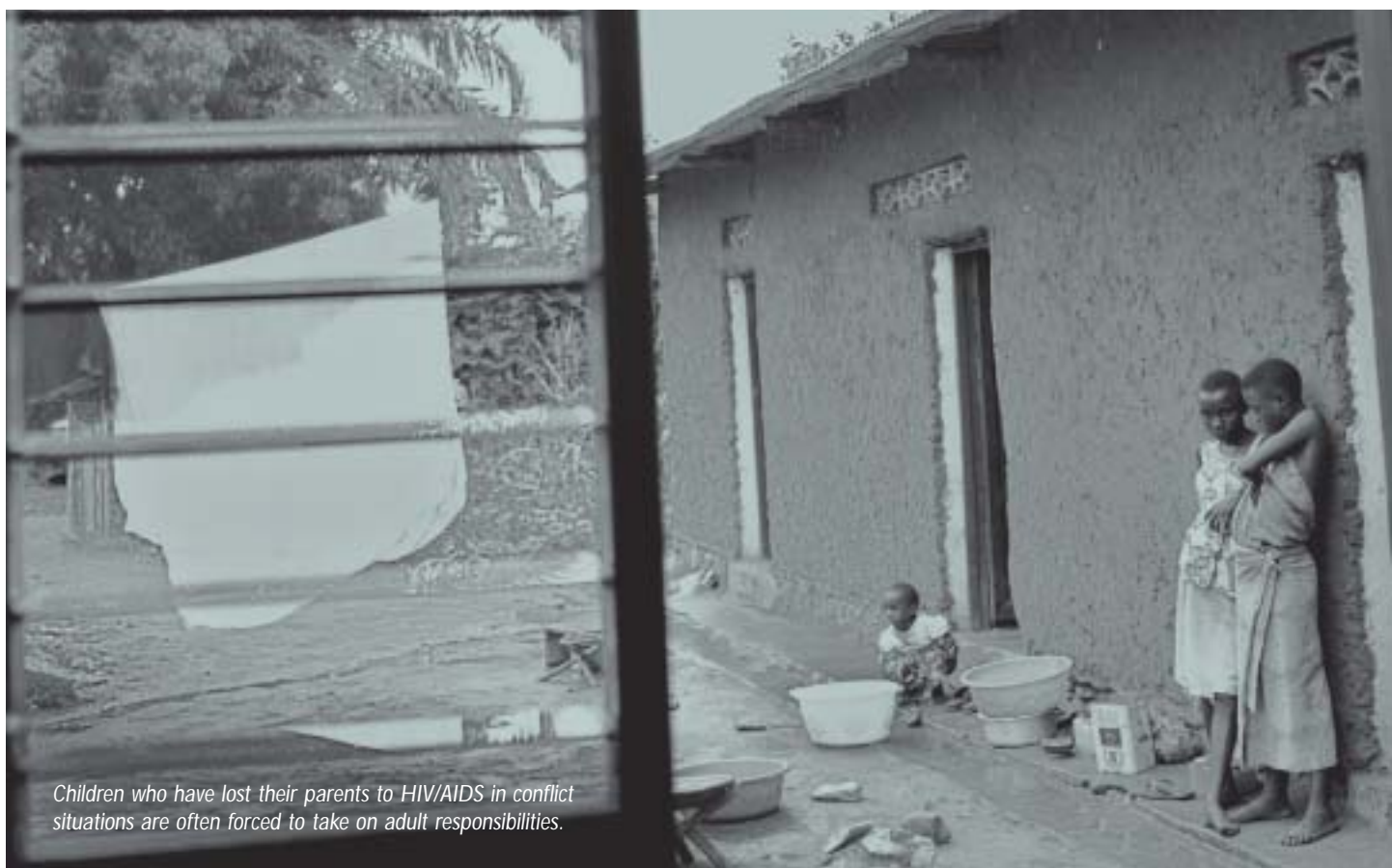
Children who have lost their parents to HIV/AIDS in conflict situations are often forced to take on adult responsibilities.

The rich countries must stop backing warring parties in Africa and supplying weapons. Instead, they should help to rebuild the countries."