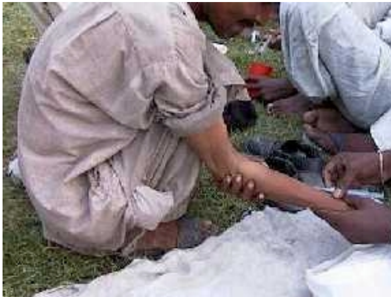
Injecting drug users (IDUs) in Lahore, Pakistan. A recent UNAIDS/UNDCP study amongst IDUs in Lahore indicated high rates of needle sharing and Hepatitis, indicating high potential for HIV transmission

“The incidence of substance abuse, particularly amongst the socio-economically marginalised sections of the society and amongst the students and youth, is increasing. While at micro level, it affects the individual and his family, at the macro level, it has a direct bearing on the social harmony, law & order and economic productivity. The main focus of concern has shifted to the effect of drug use on the health of persons. With the increasing correlation between the spread of HIV/AIDS and drug use, it is necessary that current strategies are reviewed and reworked.”