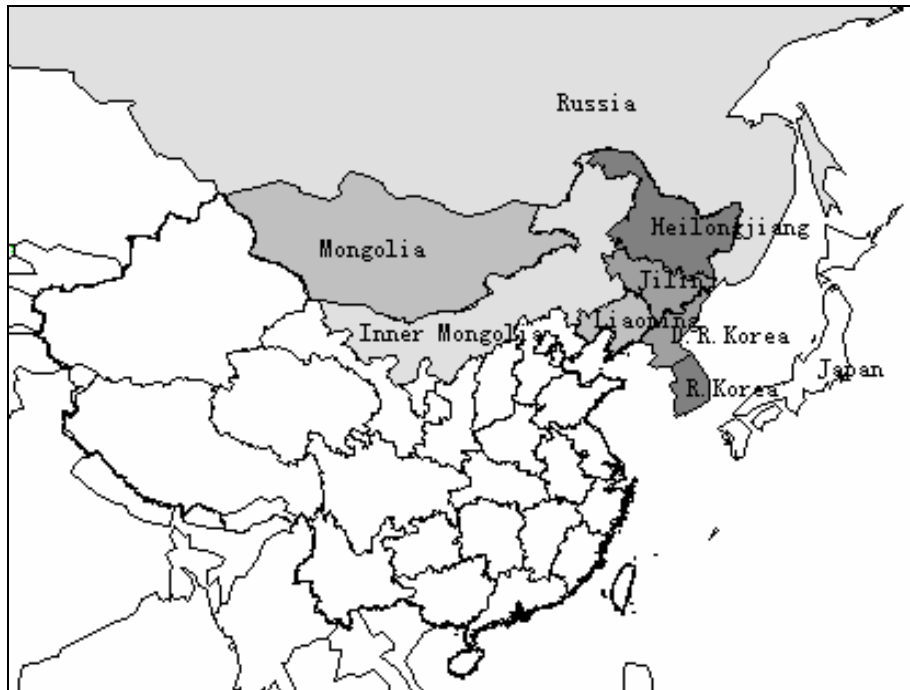
Figure 1: The location and neighboring countries of Northeast China